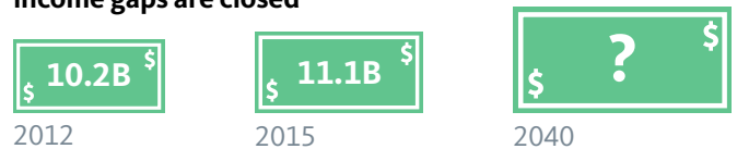
Estimated increase in the Albuquerque Metro GDP if racial income gaps are closed