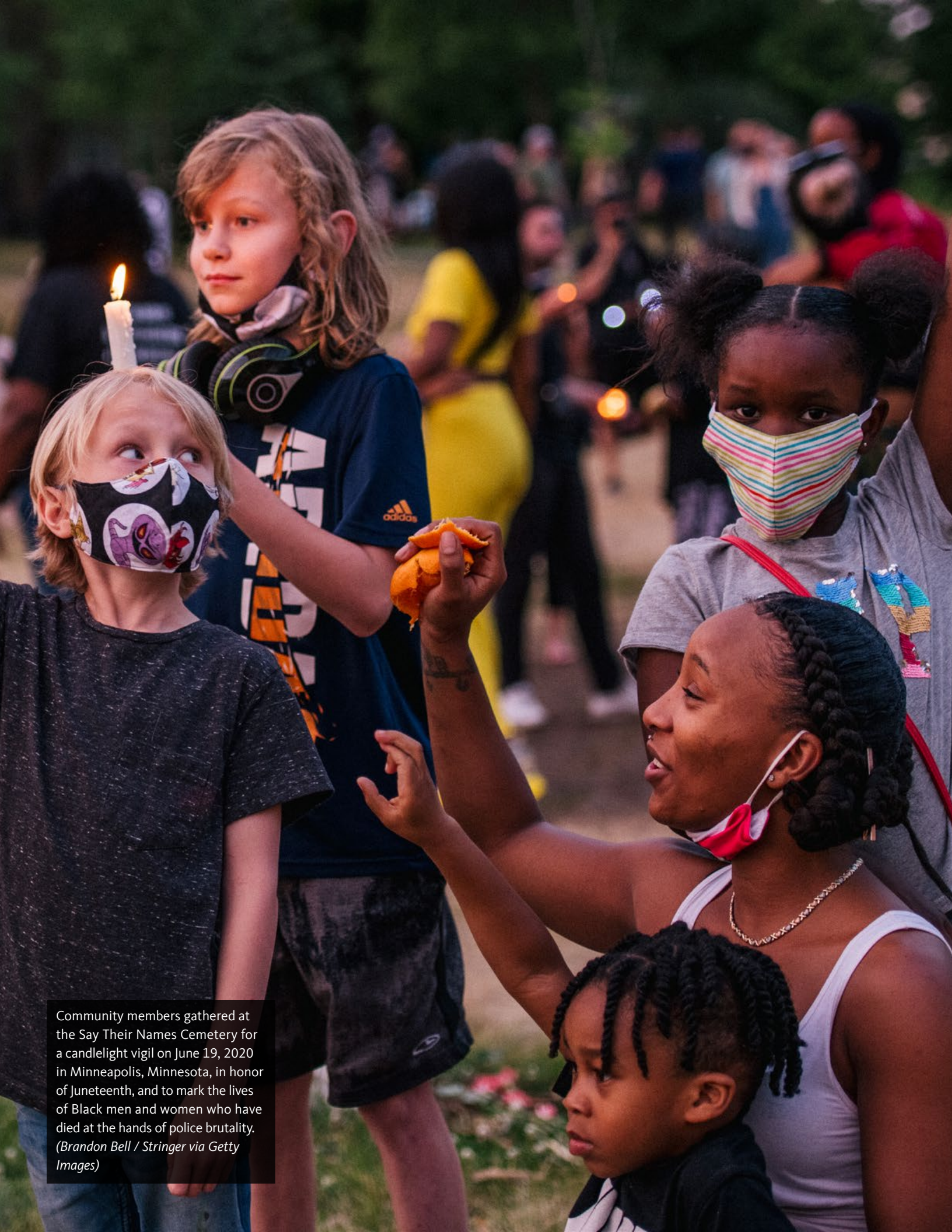
Community members gathered at the Say Their Names Cemetery for a candlelight vigil on June 19, 2020 in Minneapolis, Minnesota, in honor of Juneteenth, and to mark the lives of Black men and women who have died at the hands of police brutality.