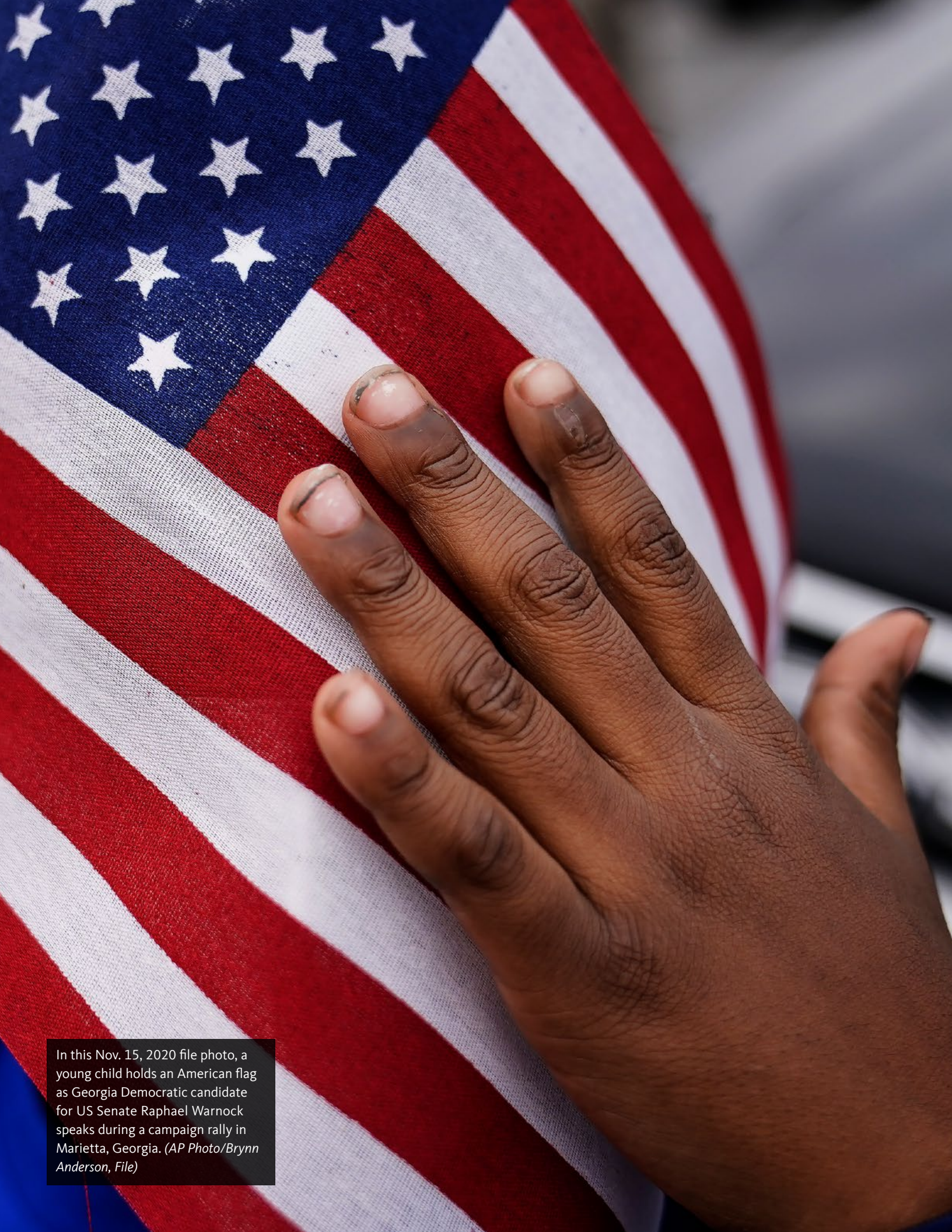
In this Nov. 15, 2020 file photo, a young child holds an American flag as Georgia Democratic candidate for US Senate Raphael Warnock speaks during a campaign rally in Marietta, Georgia.