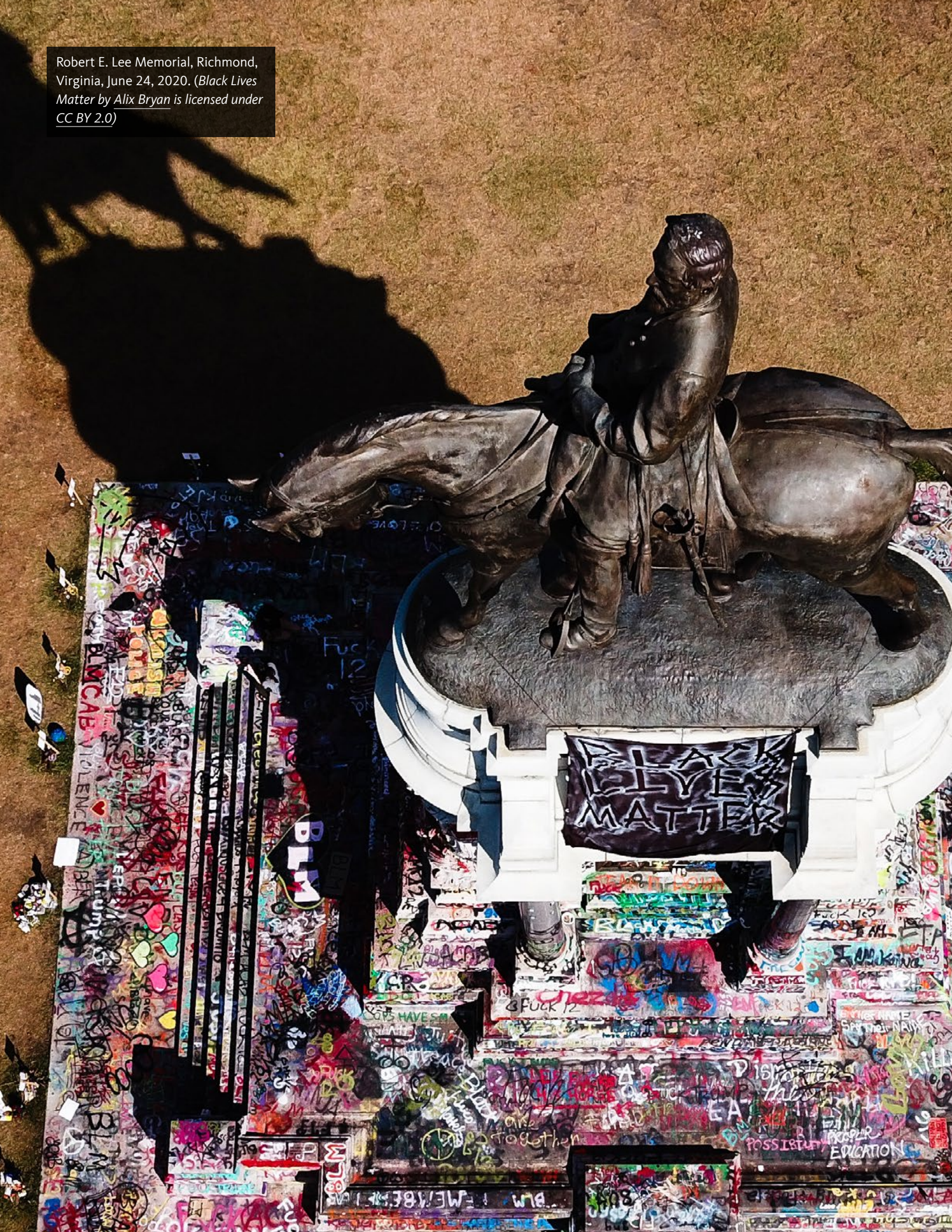
Robert E. Lee Memorial, Richmond, Virginia, June 24, 2020.