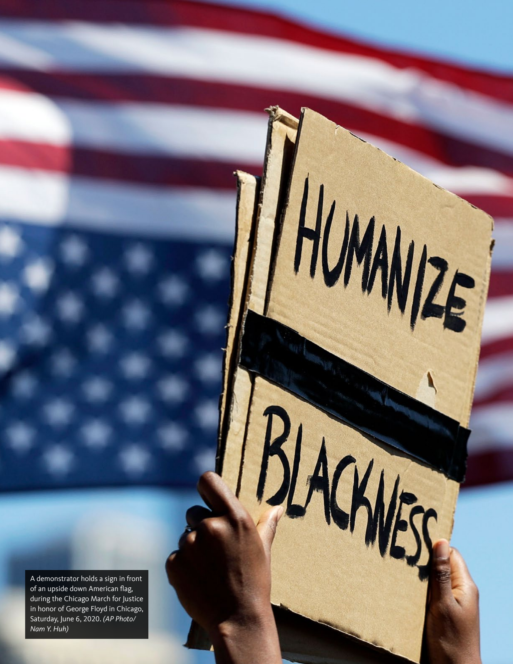
A demonstrator holds a sign in front of an upside down American flag, during the Chicago March for Justice in honor of George Floyd in Chicago, Saturday, June 6, 2020.